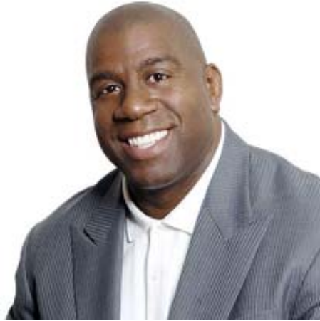
Earvin "Magic" Johnson Chairman and CEO of Magic Johnson Enterprises