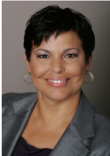
Debra Lee Chairman and Chief Executive Officer BET Networks

Debra Lee is the Chairman and Chief Executive Officer of BET Networks, a unit of Viacom Inc. (NYSE: VIA, VIA.B) and the nation's leading provider of quality entertainment for the African-American audience and consumers of Black culture. Ms. Lee oversees one of the most influential multiplatform media companies in the world, including several cable television networks, digital offerings, and a home entertainment business. Ms. Lee has led BET's successful original programming strategy that has created hits such as The Mo'Nique Show , Monica: Still Standing , Sunday Best and many more. In addition, Ms. Lee has helped guide BET's reinvigorated approach, which is built on supporting families, embracing and encouraging their dreams, focusing on the issues that are important to them and presenting the freshest talent and entertainment. In September 2009, Ms. Lee managed the launch of CENTRIC, the 24-hour entertainment network featuring the artists, music, series, movies and reality programming that reflects the lifestyle and sophistication of today's African-American and multi-cultural adult. She also oversees the company's current growth initiatives, including international distribution of the brand in the United Kingdom and Africa.