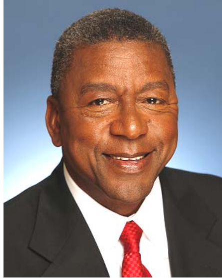
Robert L. Johnson Founder and Chairman, The RLJ Companies